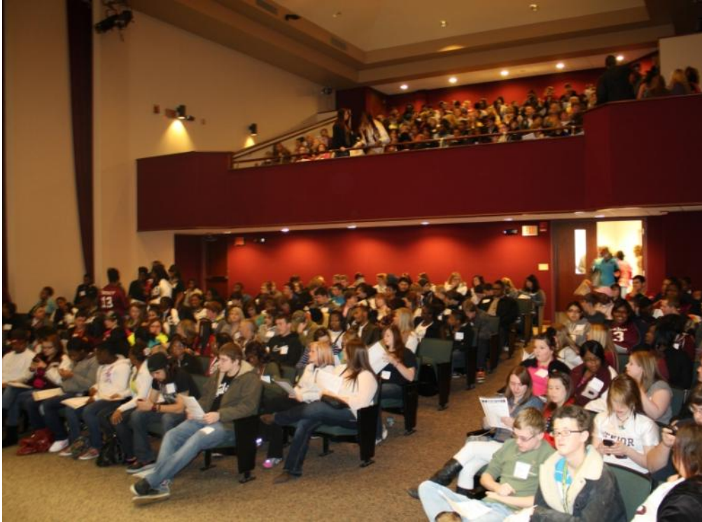
Students from area schools filled the Adams/Vines Recital Hall to capacity last Friday, as they convened on campus to learn about ANC's educational programs and related career opportunities.

ANC's annual Preview Day for high school students was held last week on the Blytheville Main Campus. Approximately 300 students from Northeast Arkansas and Southeast Missouri were in attendance.