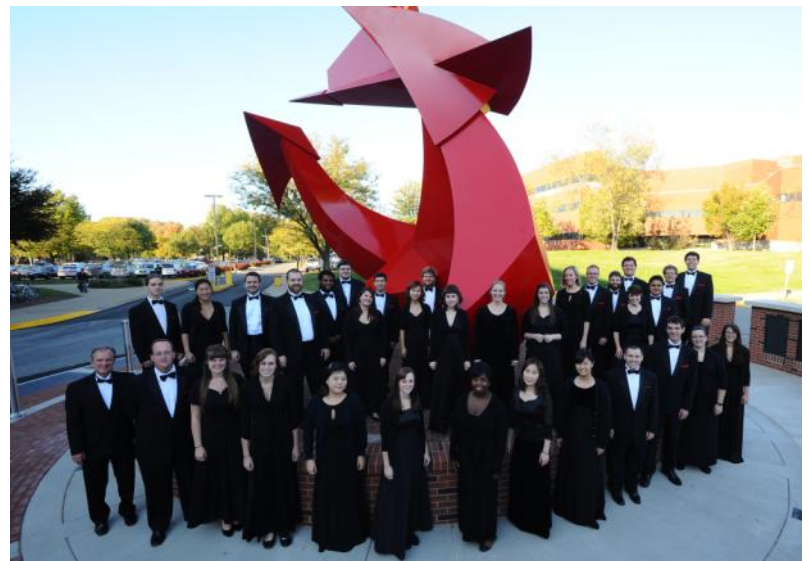
The University of Louisville Cardinal Singers