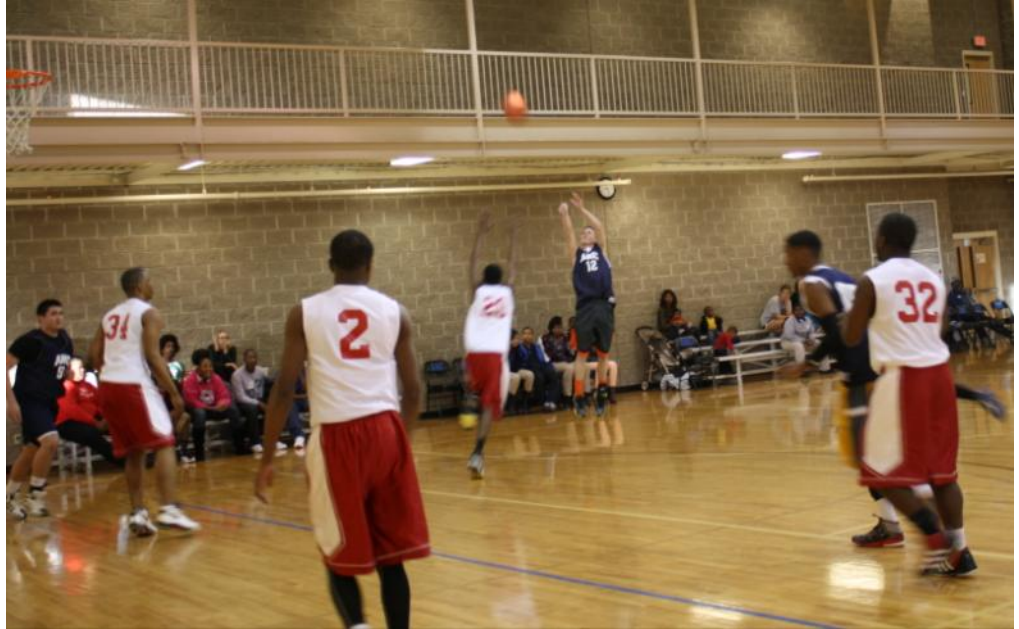
ANC team member takes a long three point shot during the 2/12/13 game against PCCUA.