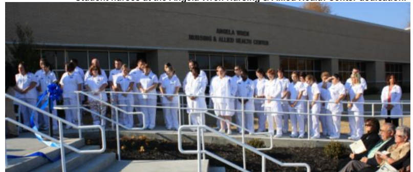
Student nurses at the Angela Wren Nursing & Allied Health Center dedication.